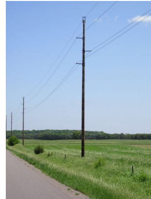
Typical 115 kV wood single circuit structure

The poles will be round wood, wood laminate and steel poles. The poles will range in height from 65 to 90 feet above ground. (see example photo above). The span between poles will range from 350 to 450 feet apart.