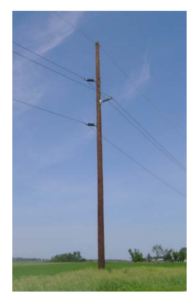
Typical 69-kV single circuit structure